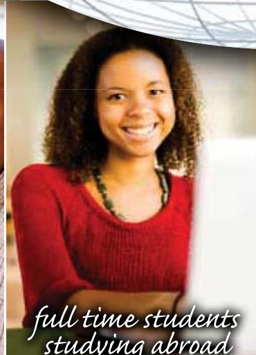
full time students studying abroad