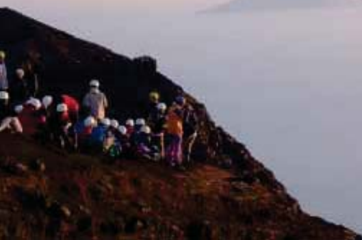
Stromboli Volcano - Sicily, Italy